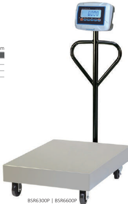
BSR6300P | BSR6600P