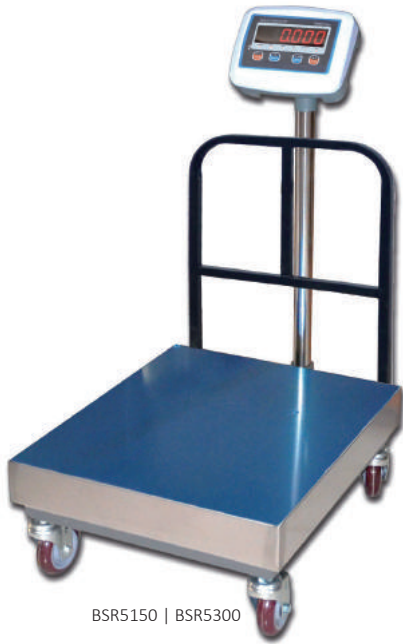
BSR5150 | BSR5300