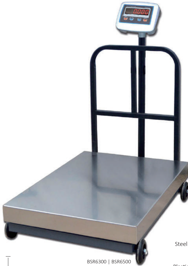
BSR6300 | BSR6500